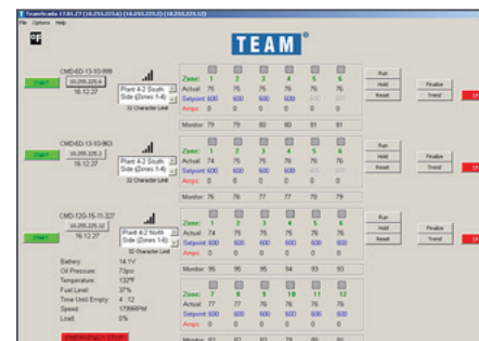
Main View screen

To learn how TEAM's SmartHeat® System can lower labor costs while increasing heat-treating and record keeping accuracy, call 1-800-662-8326.